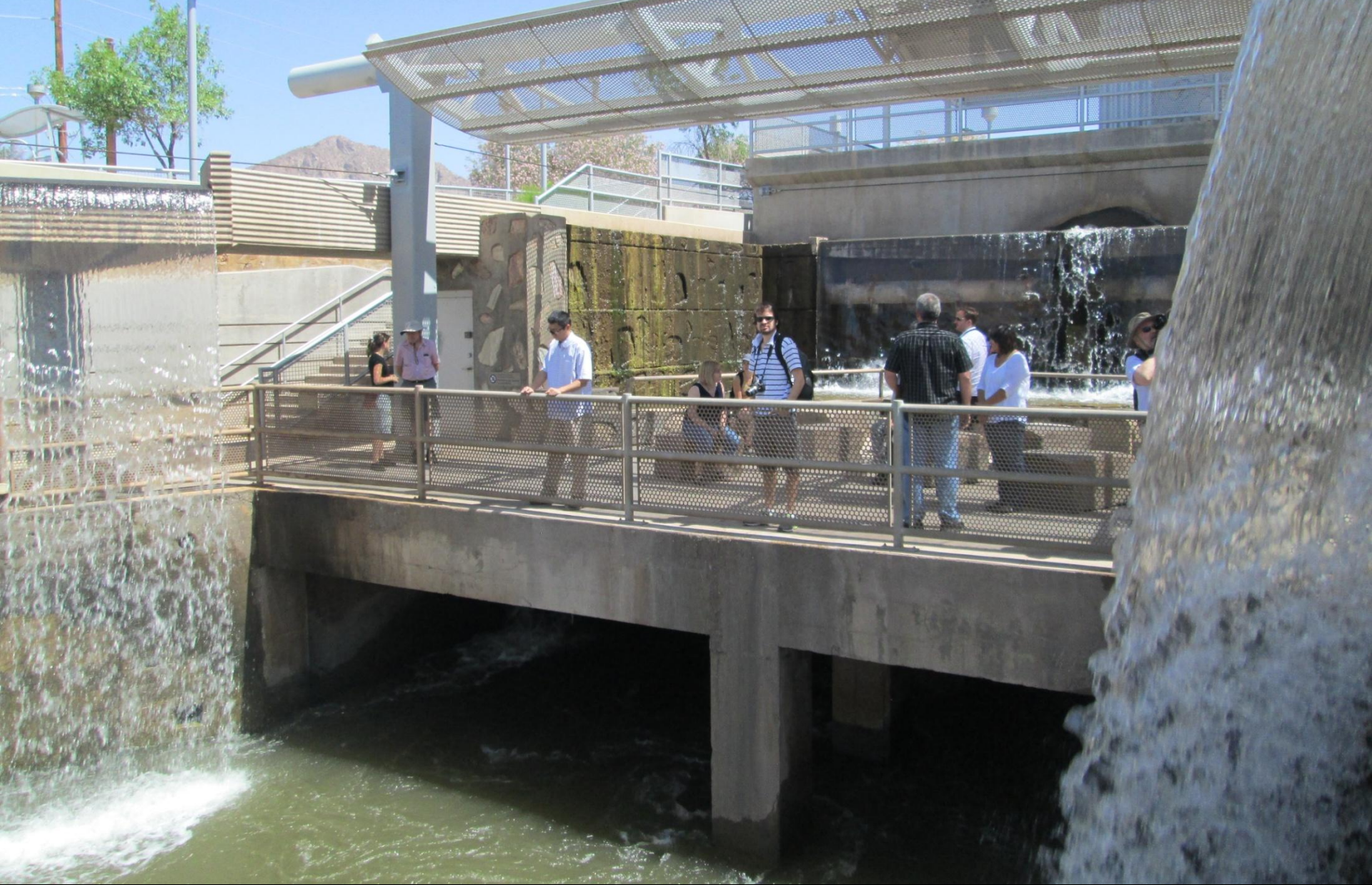
Visit to Salt River