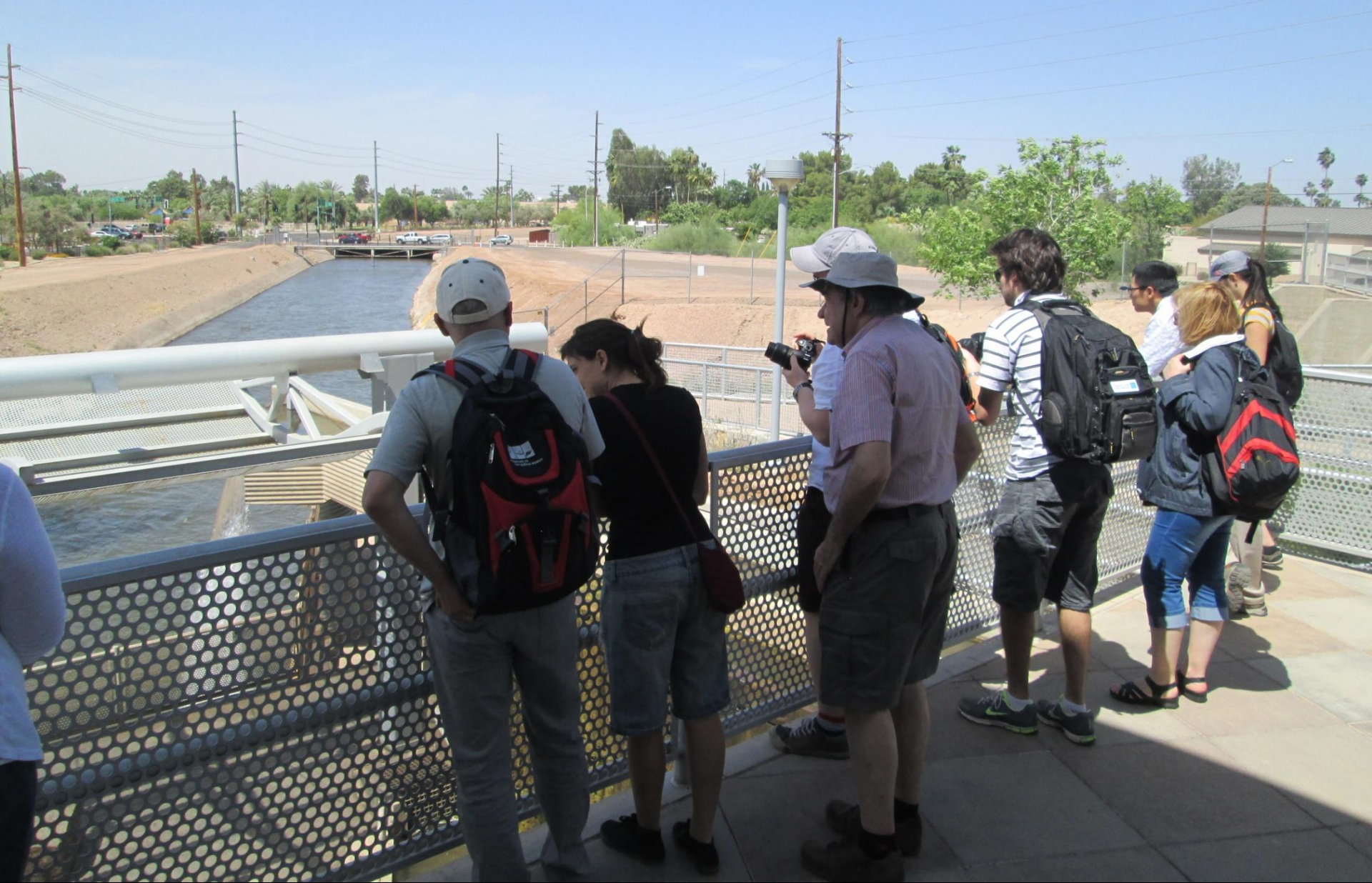
Visit to Salt River