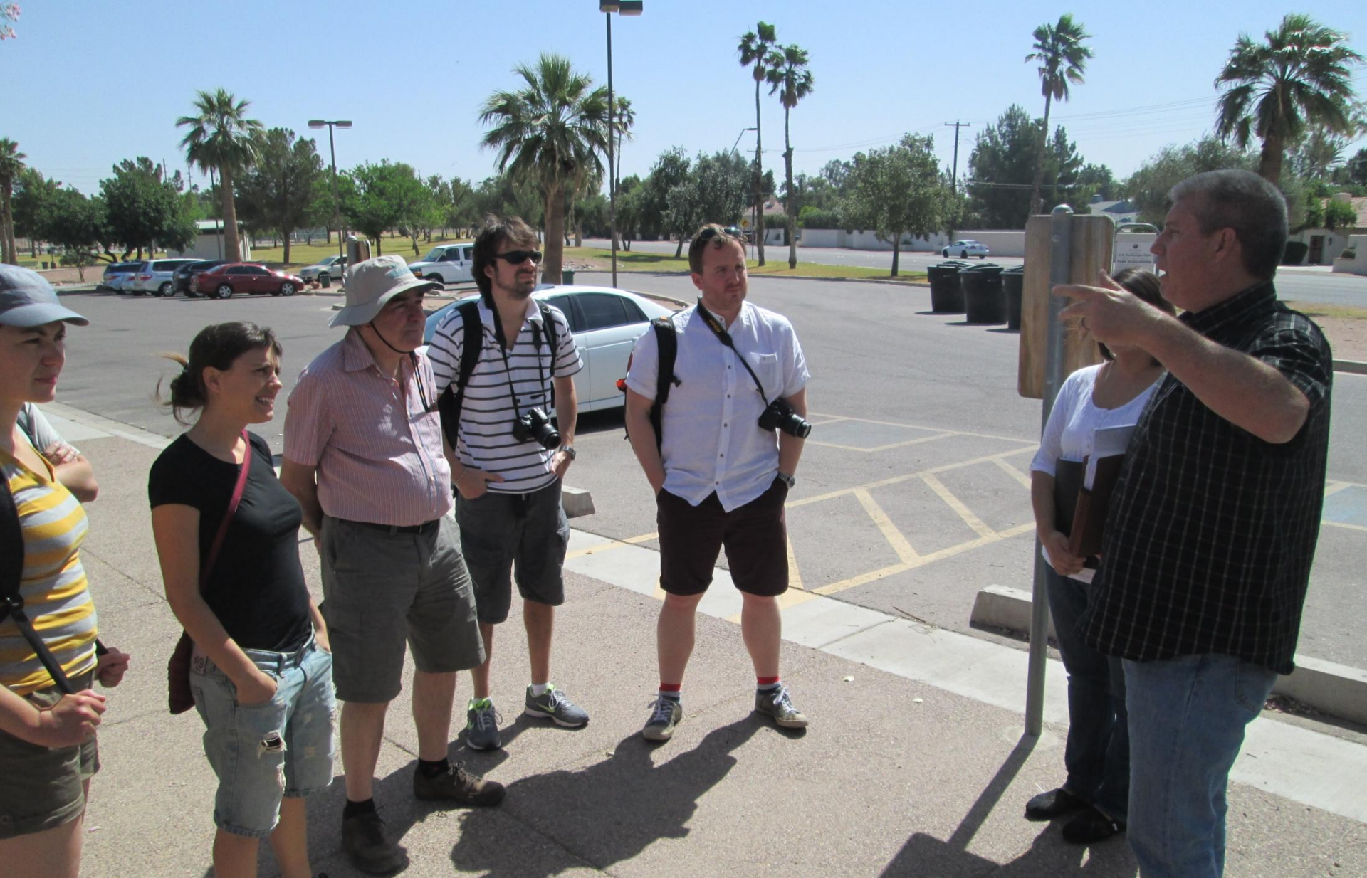
Visit to Salt River