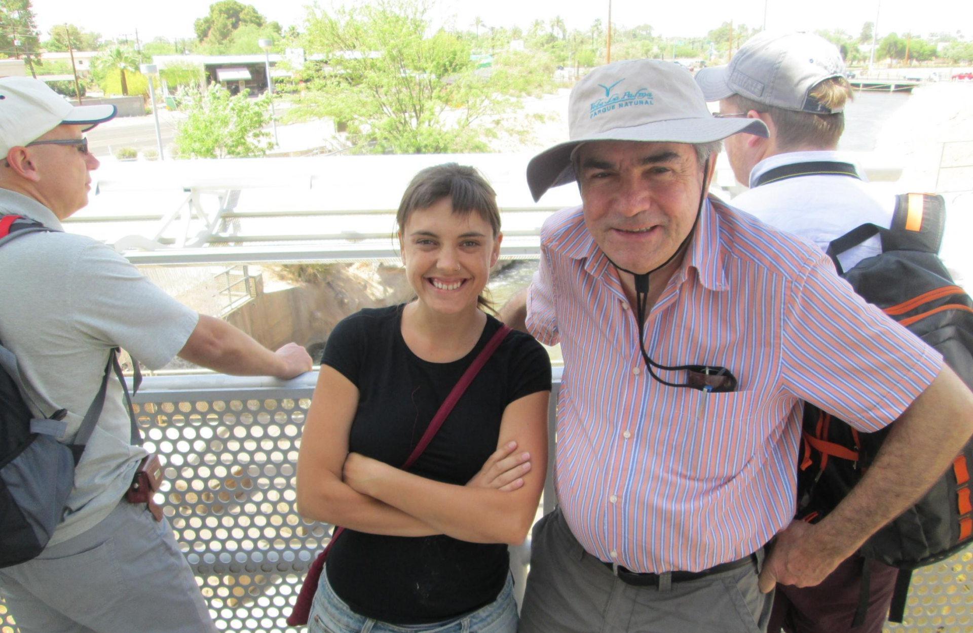
Visit to Salt River