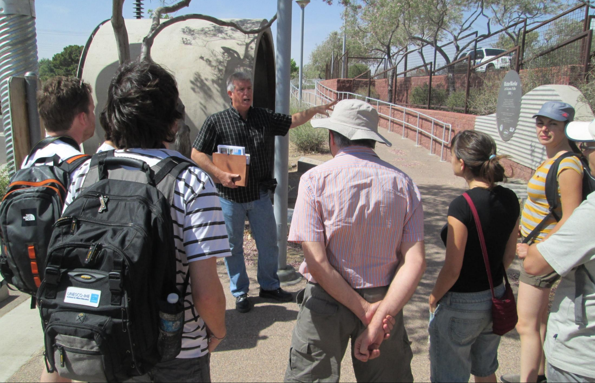
Visit to Salt River