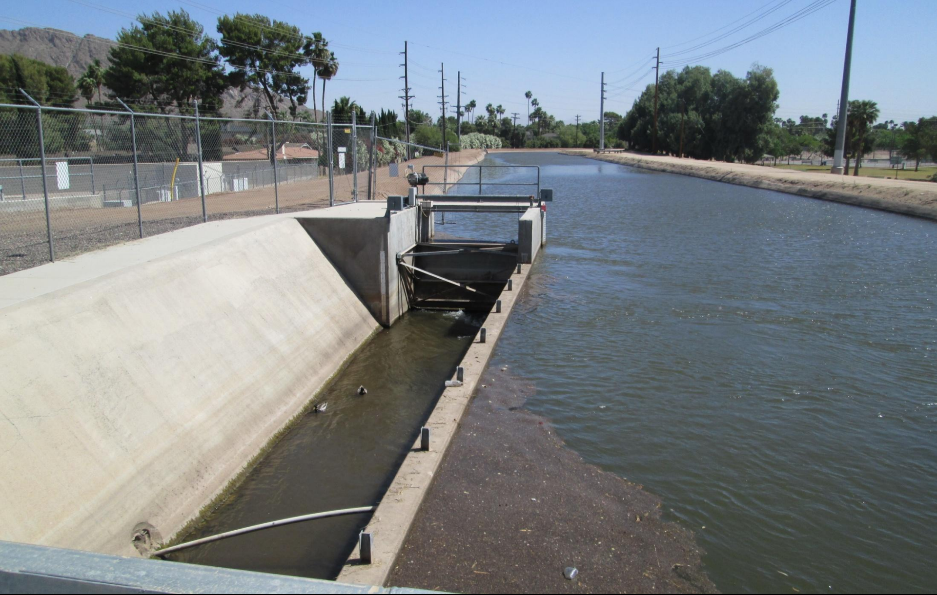
Visit to Salt River