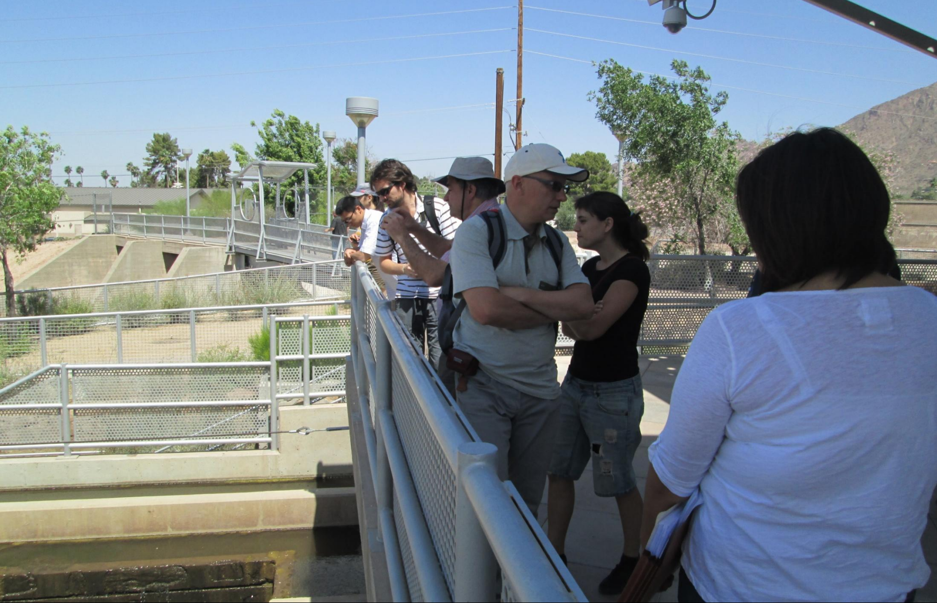
Visit to Salt River